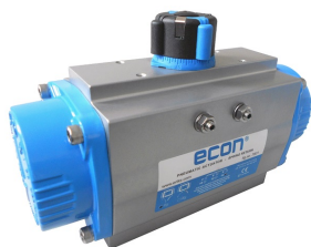
Fig. 7901 Pneumatic actuator valve